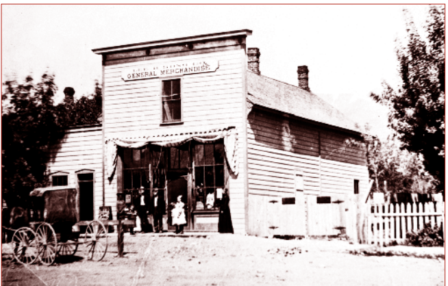
General Merchandise Store, built 1879

Mountain men in search of beaver were the first white visitors to Cache Valley. During the years of the Rocky Mountain fur