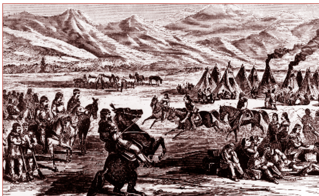
Artist's Rendition, Mountain Man Summer Rendezvous Scene

gathering quickly turned from a fur trading fair to a wild fiesta. James P. Beckwourth, a participant in the 1826 Rendezvous, left the following description of the event: “It may well be supposed that the arrival of such a vast amount of luxuries from the East did not pass off without a general celebration. Mirth, songs, dancing, shouting, trading, running, jumping, singing, racing, target-shooting, yarns, frolic, with all sorts of extravagances that white men or Indians could invent, were freely indulged in. The unpacking of the medicine water contributed not a little to the heightening of our festivities.” The trappers at the rendezvous also celebrated the Fourth of July by firing their guns and making toasts. This unique gathering lasted for two weeks.