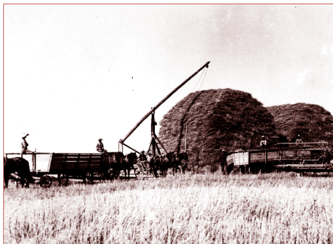
Threshing Scene at Peterson Farm in Petersboro, ca. 1908

EVENTS: Martin Harris Pageant, held during in August; Clarkston Pony Express Days, third weekend in June.