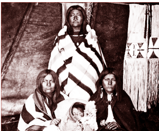
Shoshone Indian Women, ca 1870