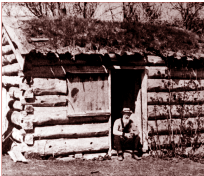
Baker Cabin, Mendon, ca. 1860

EVENT: Mendon May Day Celebration (May 1).