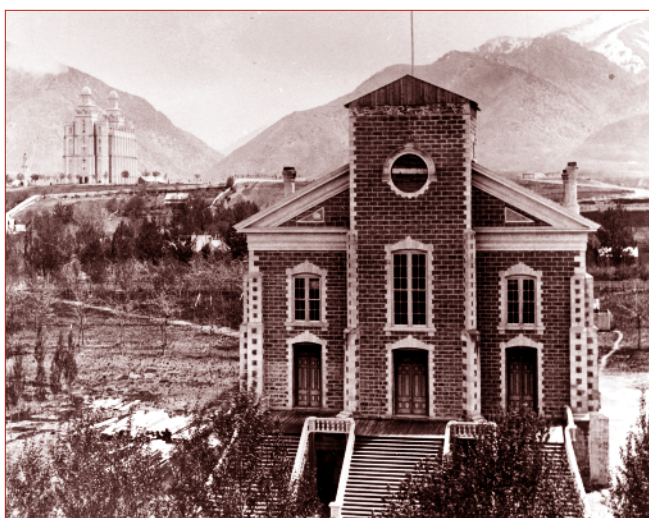
LDS Tabernacle, LDS Temple in Background, ca. 1870s

EVENTS: Cache Valley Cruise In, first Saturday in July; Utah Festival Opera, July-August; Fourth of July Celebration; Pioneer Day, July 24th; Cache County Fair and Rodeo, August; Old Lyric Repertory Theatre, June-July. See www.tourcachevalley.com for full calendar.