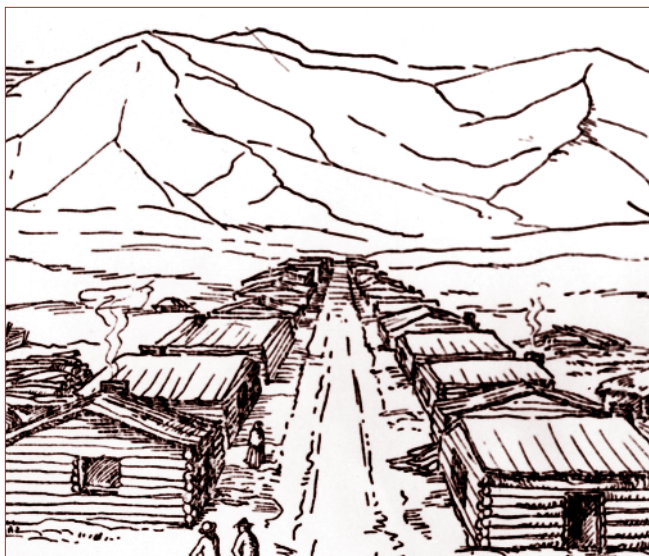
Layout Sketch of Fort Hyrum

EVENTS: Cache Valley Mountain Man Rendezvous, Blacksmith Fork Canyon, Memorial Day; Hardware Ranch Elk Festival, 2nd week in October, Fourth of July parade and rodeo; Star-Spangled Week, 4th of July celebration; Top of Utah Marathon, Blacksmith Fork Canyon, September.